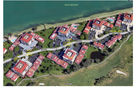
Built in 1977 - 130 units - 6 floors

Casa Del Mar II 6177 Sun Blvd, Saint Petersburg, FL 33715 (727) 864-2433