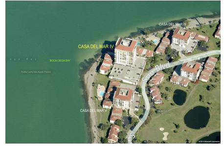
Built in 1978 - 119 units - 12 floors

Casa Del Mar III Coa 6211 Sun Blvd, Saint Petersburg, FL 33715 (727) 867-5167