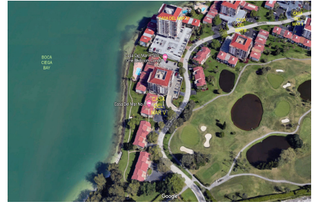
Built in 1978 - 64 units - 6 floors