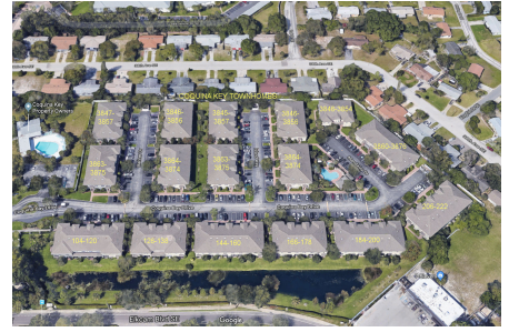
Built in 2005 - 136 units - 2 floors

Number of units: 136 Number of active listings for rent: 0 Number of active listings for sale: 0 Building inventory for sale: Number of sales over the last 12 months: 0% Number of sales over the last 6 months: 3 Number of sales over the last 3 months: 3