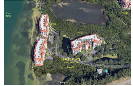
Built in 1995 - 126 units - 6 floors

Dolphin Cay Property Owners Association, Inc. Office 727.864.1900 Fax 727.864.2073 Gatehouse 727.866.2385 727.865.9190 http://dolphincay.com/