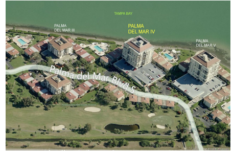
Built in 1981 - 144 units - 12 floors

Palma del Mar V management 3001 Executive Dr. Suite 260 Clearwater, FL 33762 (727) 573-9300 (answered 24 hours) http://info@condominiumassociates.com