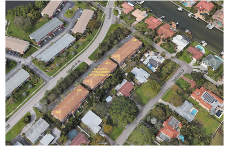
Built in 2006 - 18 units - 2 floors

Sun Ketch Construction Inc Address: 2401 28th Ave N, St. Petersburg, FL 33713 Phone: +1 727-592-0289