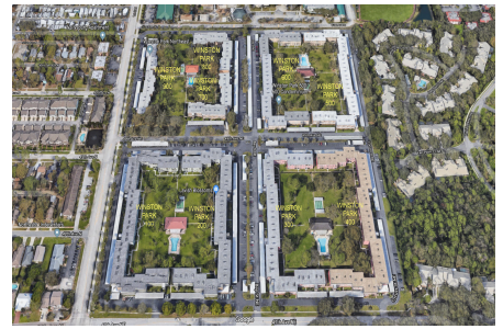
Built in 1971 - 114 units - 3 floors

Winston Park Northeast 5085 1st St NE, St. Petersburg, FL 33703 Phone: +1 727-528-7019