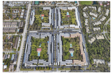
Built in 1973 - 102 units - 3 floors

Winston Park Northeast 5085 1st St NE, St. Petersburg, FL 33703 Phone: +1 727-528-7019