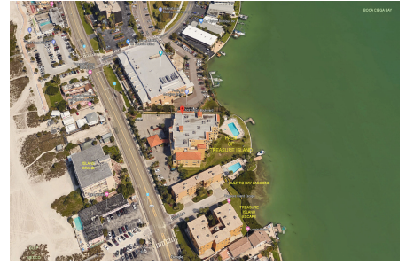
Built in 2008 - 36 units - 4 floors