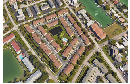
Built in 1988 - 111 units - 2 floors

Number of units: 111 Number of active listings for rent: 0 Number of active listings for sale: 2 Building inventory for sale: 1% Number of sales over the last 12 months: 9 Number of sales over the last 6 months: 4 Number of sales over the last 3 months: 4