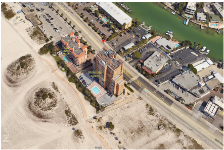
Built in 1974 - 46 units - 15 floors

Treasure Sands Condominium Address: 11000 Gulf Blvd, Treasure Island, FL 33706 Phone: +1 727-367-2029