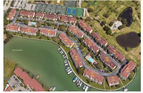
Built in 1980 - 98 units - 3 floors