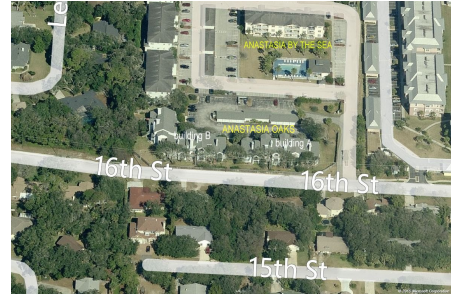
Built in 1986 - 22 units - 3 floors

ANASTASIA OAKS CONDOMINIUM ASSOCIATION, INC. MAY MANAGEMENT SERVICES INC 475 WEST TOWN PLACE # 112 ST AUGUSTINE FL 32092 PHONE 904-561-9708 FAX 904-461-0335