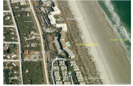
Built in 1985 - 66 units - 4 floors

Barefoot Trace Condominium Association, 6240 A1A South St Augustine, FL 32080 Phone: (904) 471-9212 http://barefoottracefl.com/