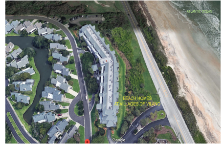
Built in 1989 - 61 units - 3 floors

Villages of Vilano HOA c/o Coastal Realty & Property Management 3942 A1A South, St. Augustine, FL 32080 Ph: 904-471-6606 Fax: 904-471-2866 https://villagesofvilano.wordpress.com/