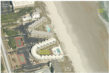
Built in 1973 - 51 units - 3 floors

Crescent Sandpiper Condominium Address:7950 A1A S St Augustine FL32080 Phone:(904) 471-0056 fax:(904) 471-4455 email:crescent.sandpiper1@gmail.com http://www.crescentsandpiper.com/