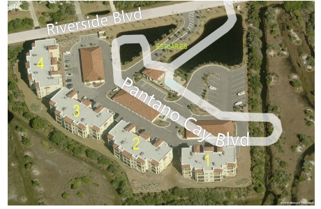
Built in 2007 - 56 units - 3 floors

Estuaries Condo Association 120 Pantano Cay Blvd, St Augustine, FL 32080 (904) 471-7461