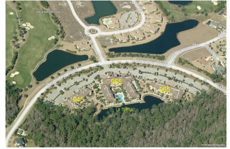
Built in 2004 - 149 units - 3 floors

Laterra Condominium Association Inc 965 Registry Blvd, Saint Augustine, FL 32092 (904) 940-5183 Laterra Condominium Complex Address: 955 Registry Blvd, St Augustine, FL 32092, (904) 940-5684