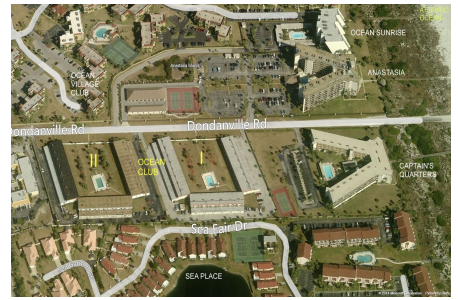
Built in 1984 - 86 units - 2 floors

Ocean Club Association II Coastal Realty & Property Management 3942 A1A South, St Augustine, FL 32080 904-471-6606 ext. 309 http://oceanclub2.wordpress.com/