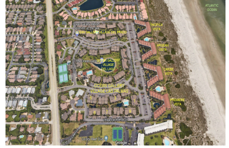
Built in 1982 - 73 units - 3 floors

Ocean Gallery Property Management, 4600 A1A South, St. Augustine, FL 32080, 904-471-6655 https://oceangalleryprop.com/the-village-las-palmas-condominium-association-inc-m