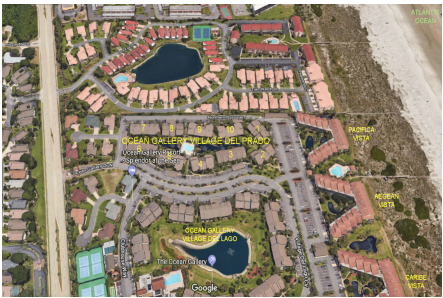
Built in 1985 - 83 units - 3 floors

Ocean Gallery Property Management, 4600 A1A South, St. Augustine, FL 32080, 904-471-6655 https://oceangalleryprop.com/the-village-del-prado-condominium-association-inc-m