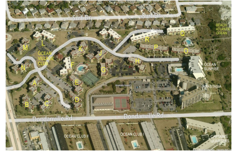
Built in 1985 - 348 units - 3 floors

Ocean Village Club 4250 A1A S St Augustine FL 32080 (904) 471-7022 http://www.oceanvillageclub.org/