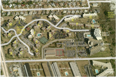
Built in 1985 - 348 units - 3 floors

Ocean Village Club 4250 A1A S St Augustine FL 32080 (904) 471-7022 http://www.oceanvillageclub.org/