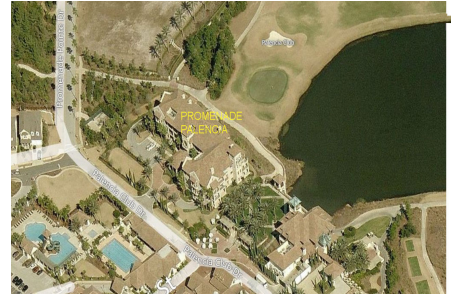
Built in 2006 - 15 units - 3 floors

The Promenade At Palencia Condominium Association 5455 A1A South Saint Augustine, FL 32080 Phone: (904) 584-1057