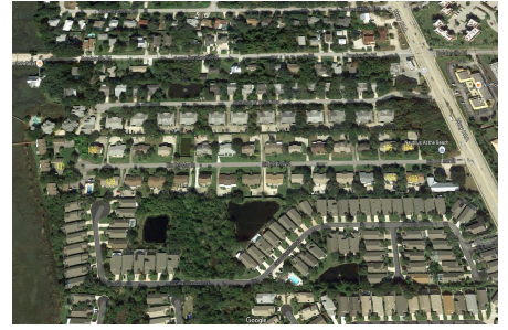
Built in 1983 - 93 units - 1 floor

Rio Del Mar Condominium No One Association Inc 1845 Old Moultrie Road Saint Augustine, FL 32080 Phone: (904) 826-3302