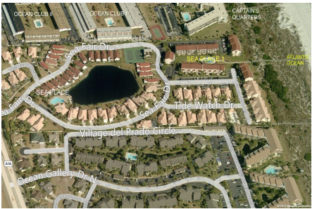
Built in 1985 - 78 units - 3 floors

Sea Place Homeowners Association 4400 A1A S, St Augustine, FL 32080 (904) 471-4925