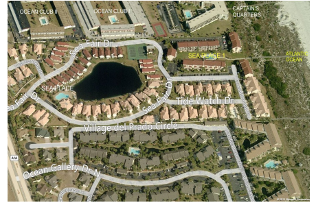
Built in 1985 - 78 units - 3 floors

Sea Place Homeowners Association 4400 A1A S, St Augustine, FL 32080 (904) 471-4925