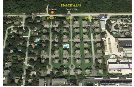
Built in 2006 - 164 units - 2 floors

Seaside Villas on Anastasia Island 30 Clipper Court St. Augustine Beach, FL 32080 p: (904) 471-0065 f: (904) 471-9015 http://www.psdm-seasidevillas.com/Apartments/module/home/is_full_version/1/