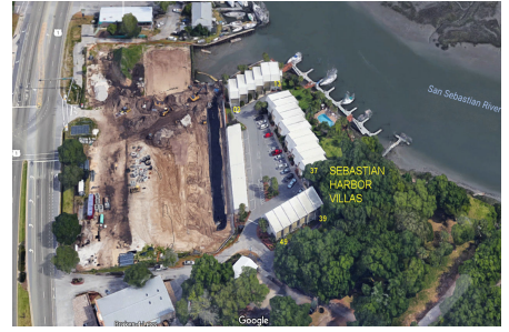
Built in 1986 - 24 units - 3 floors