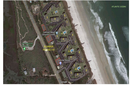
Built in 1981 - 256 units - 3 floors