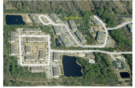
Built in 2004 - 178 units - 3 floors

VILLA SAN MARCO CONDOMINIUM ASSOCIATION, INC 1637 RACE TRACK RD # 206 ST JOHNS FL 32259 PHONE 904-561-9708 FAX 904-461-0335