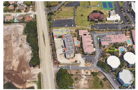
Built in 2006 - 27 units - 3 floors

Villas of Ocean Gate II Condo Association 264 Gibraltar Ct, Saint Augustine, FL 32080 (904) 471-4689