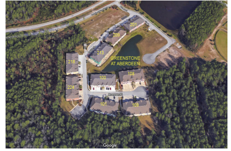
Built in 2010 - 108 units - 2 floors

Greenstone At Aberdeen Condominium Association, Inc 205 Waler Way Suite 5 St Augustine FL 32086