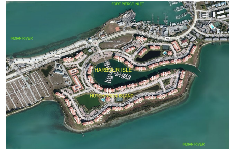
Built in 2005 - 288 units - 4 floors

HARBOUR ISLE EAST Condominium Association Bristol Management Services, Inc. 1930 Commerce Lane, Suite 1 Jupiter, FL 33458 (772) 595-3660 http://www.harbourisleeast.org/