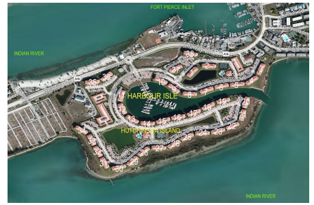
Built in 2005 - 624 units - 4 floors

Managed By Elliott-Merrill Community Management office address 14-A Harbour Isle Drive West Fort Pierce, FL 34949 (772) 466-5512 http://www.harbourislewest.com/index.php