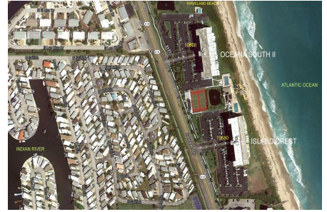
Built in 1982 - 126 units - 12 floors

Island Crest Condominium Association 10680 S Ocean Drive Jensen Beach, FL 34957 Phone: (772) 229-1897