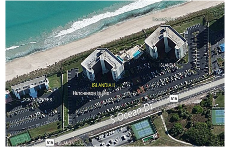
Built in 1982 - 194 units - 20 floors

Islandia II Condominium Association Inc 9550 S Ocean Dr # OFC, Jensen Beach, FL 34957-2327 (772) 229-3591 http://www.islandiai.com/