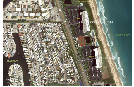
Built in 1981 - 126 units - 12 floors

Oceana South Condominium Association, Inc. 10600 South Ocean Drive Jensen Beach, FL 34957 Tel: (772) 229-1898 Fax: (772) 229-1911 Email: os2manager@comcast.net http://oceanasouth.com/