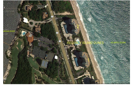
Built in 1966 - 70 units - 13 floors

REGENCY ISLAND DUNES ASSOCIATION INC 8640 S OCEAN DR JENSEN BEACH, FL 34957-2109 (772) 229-0311 http://www.regencyislanddunes.com/