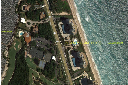
Built in 1996 - 72 units - 13 floors

Regency Island Dunes Association, Inc 8600 S Ocean Drive Jensen Beach, FL 34957 (772) 229-0311 http://Regencyislanddunes.com