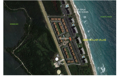
Built in 1980 - 203 units - 8 floors

After hours, office phone will be forward to the management company ADVANTAGE PROPERTY MANAGEMENT 1111 SE Federal Highway, Suite 100 Stuart, FL. 34994 tel(772) 334-8900 fax (772) 288-0175 http://www.sanddollarshores.net/