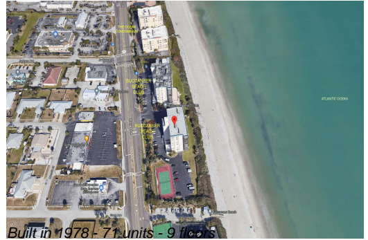
Built in 1978 - 71 units - 9 floors