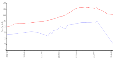
Oceanview 2150&2160 vs Indialantic