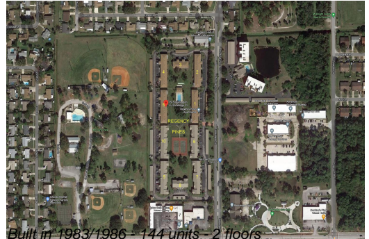
Built in 1983/1986 - 144 units - 2 floors