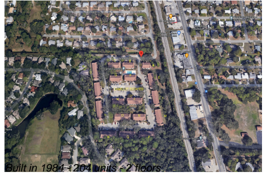
Built in 1984 - 204 units - 2 floors