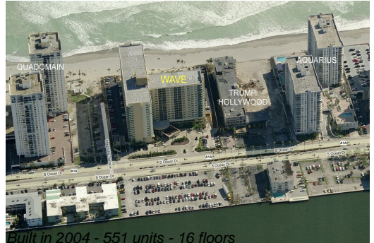
Built in 2004 - 551 units - 16 floors