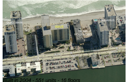
Built in 2004 - 551 units - 16 floors