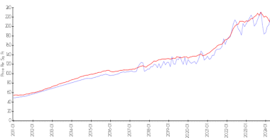
Suffolk at Century Village (A-O) vs Pembroke Pines