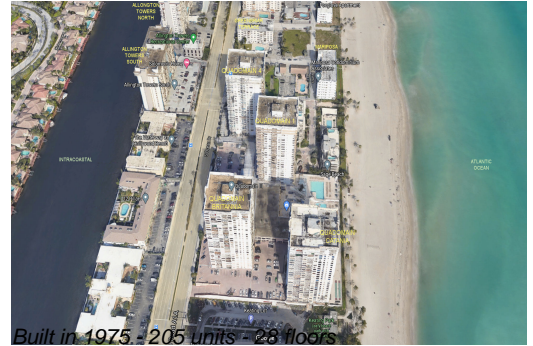
Built in 1975 - 205 units - 28 floors

MLS Number: A11503686 Status: Active Size: 1,100 Sq ft. Bedrooms: 2 Full Bathrooms: 2 Half Bathrooms: Parking Spaces: 1 Space, Guest Parking, Valet Parking View: List Price: $495,000 List PPSF: $450 Valuated Price: $436,000 Valuated PPSF: $396