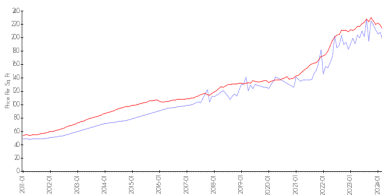
Buckingham East at Century Village vs Pembroke Pines