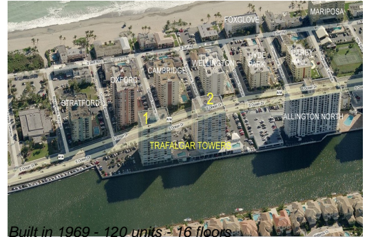
Built in 1969 - 120 units - 16 floors